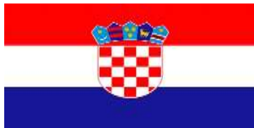
CROATIA: C:E:T platform Croatia Email: croatia@cetplatform.org