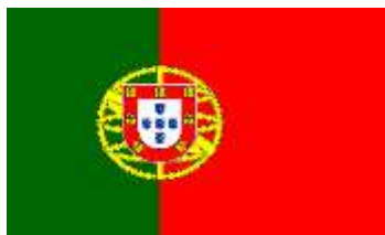
PORTUGAL CXJV Conexao Jovem Associacao Email: conexaojovem.geral@gmail.com