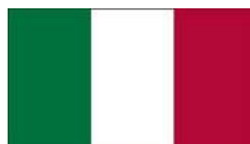
ITALY C:E:T platform Italy Email: italy@cetplatform.org