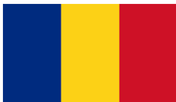
ROMANIA ATIC Romania Email: atic.romania@gmail.com