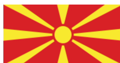
NORTH MACEDONIA C:E:T platform Skopje Email: macedonia@cetplatform.org