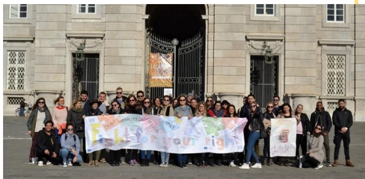
Fight for your Right – Youth Exchange, 23-30 November 2017