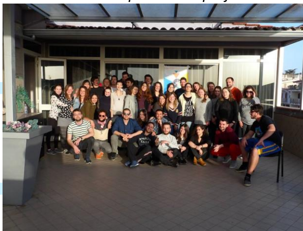
Live FEED from Europe – Youth Exchange, 19-27 February 2017

As NGO, our mission is to improve the level of competences and skills of young people and youth workers, as well as to foster intercultural learning, active citizenship and social inclusion through non-formal education principles and methodologies. Our vision is to empower youngsters to shape the world they live and work in, enhancing creativity, innovation and entrepreneurship. We want to help young people in their personal and professional growth to contribute to the sustainable development of European society.